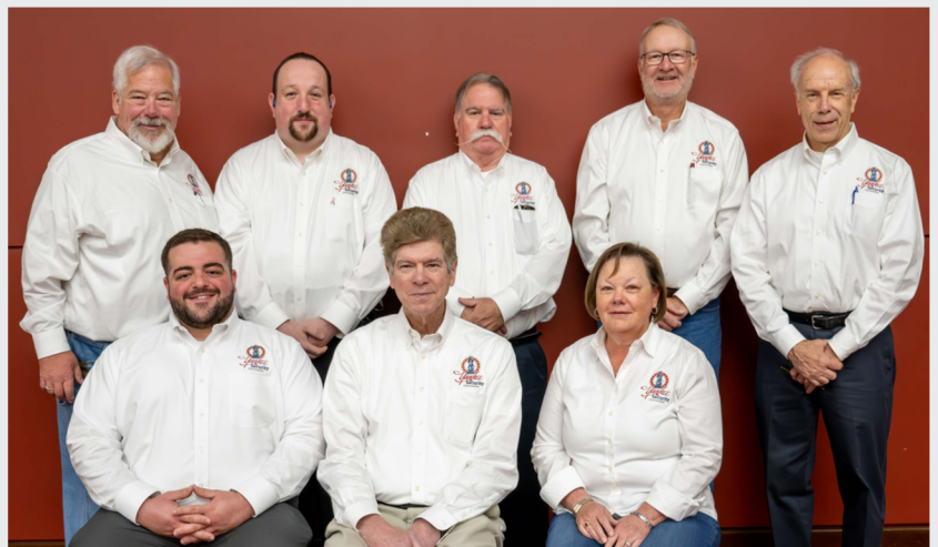
2024 Board Pictured Above

The volunteer Board of Directors are committed to making the Yankee Security Convention annual event the premier source of industry know-how in the Northeast.