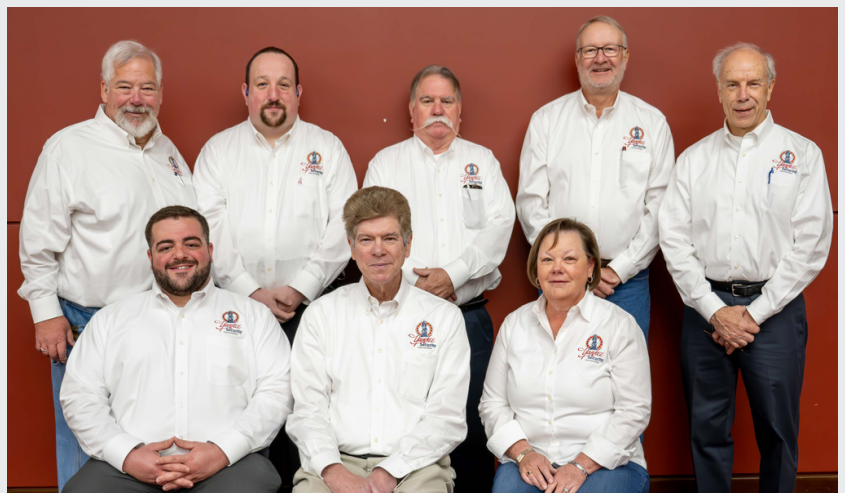
Our Volunteer Board Of Directors

The volunteer Board of Directors are committed to making the Yankee Security Convention annual event the premier source of industry know-how in the Northeast.