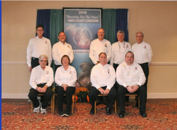
Yankee Security Board of Directors

On behalf of the Board of Directors, WELCOME TO THE YANKEE SECURITY CONVENTION. We're excited for you to join us! This year marks our 43rd annual event and our return to the Mass Mutual Center in Springfield, MA, October 25 - 29, 2023.